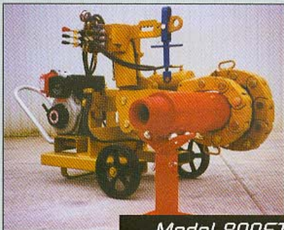
Model 800ST Horizontal Position

Break Out / Make Up Hydraulic Chain Tong