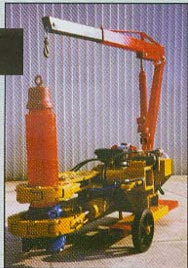
Model 800ST Vertical Position